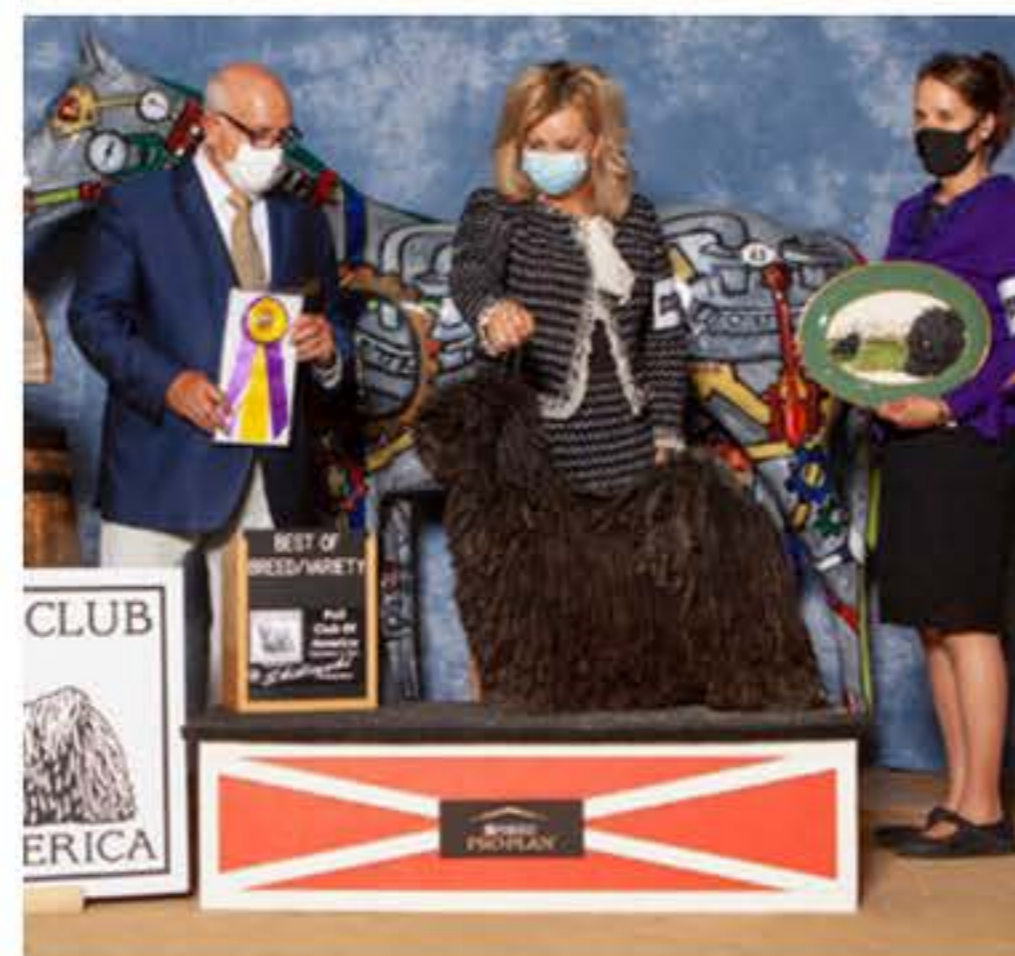
(Clockwise from top left:) Best of Breed at the 2020 Puli national specialty, Ch. Cordmaker Punchinello; Best of Breed at the 2021 Puli national specialty, GCh.B Szentmihalyi-Szabo Trefa, BCAT, CGC, TKN; and High in Trial in Obedience for the 2020 and 2021 PCA national specialties, Wyldmor the Wooden Prince at Bartok

BOW, WB, Best Puppy: Loakespark Gardenia